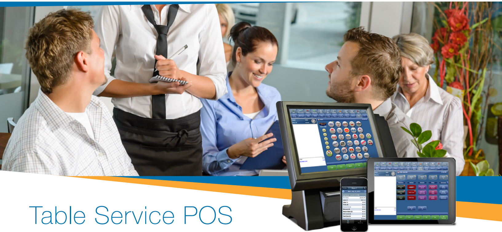
Table Service POS

From long wait times, to slow service and incorrect orders, a number of factors can lead to a poor experience at your restaurant. Focus POS helps busy restaurants manage table seating, increase table turnover and average ticket size to increase the profitability of their operations. Focus Table Service POS enables restaurants to optimize labor and streamline food preparation to ensure the best possible service.